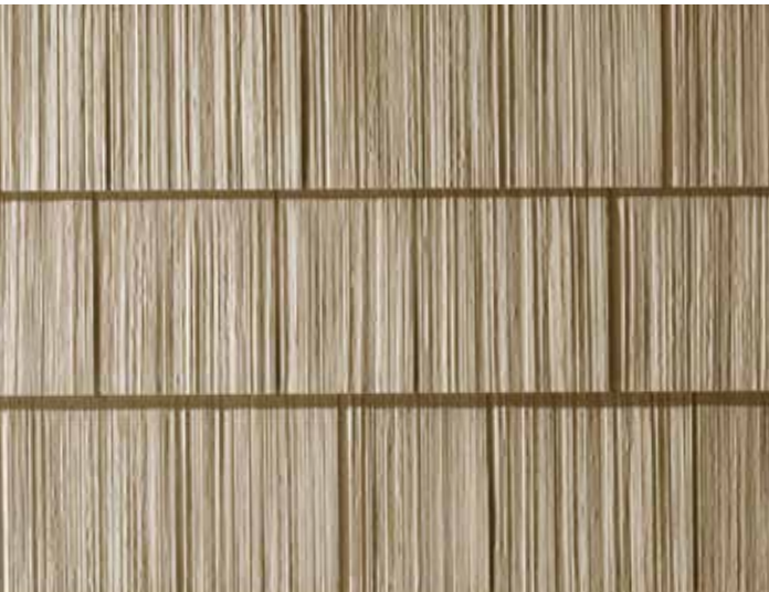
Traditional 7" shake features a remarkably authentic woodgrain texture.

There are no limits to what you can do when you imagine your perfect exterior design. From ornate and dramatic to muted and charming, customization is yours with Pelican Bay One Shakes and Scallop. Beautiful, practical, and made to last, this impressive collection features the distinctive beauty of natural-looking woodgrains without the time-consuming maintenance and costly upkeep.