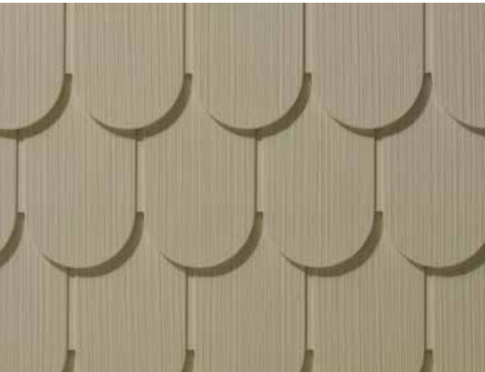
Pelican Bay One Scallops create the distinctive look and roughsawn feel of cedar half-rounds.

Pelican Bay One Shakes are ideal for coastal areas or other high-wind locations. In independent tests, they remained secure in winds equivalent to a Category 5 hurricane.